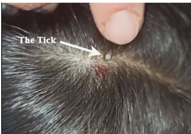
Figure 1: The infested tick on the patient's scalp.

The patient suffered from severe pain and irritability, making it difficult to tolerate any touch of the scalp. Physical examination revealed a few bleeding points, with a single grey tick ( Ixodes species) firmly attached to the scalp (Figure 1). The case had a history of contact with a cow one week prior